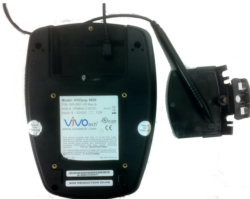
Figure 1. Remove stylus and cut bracket