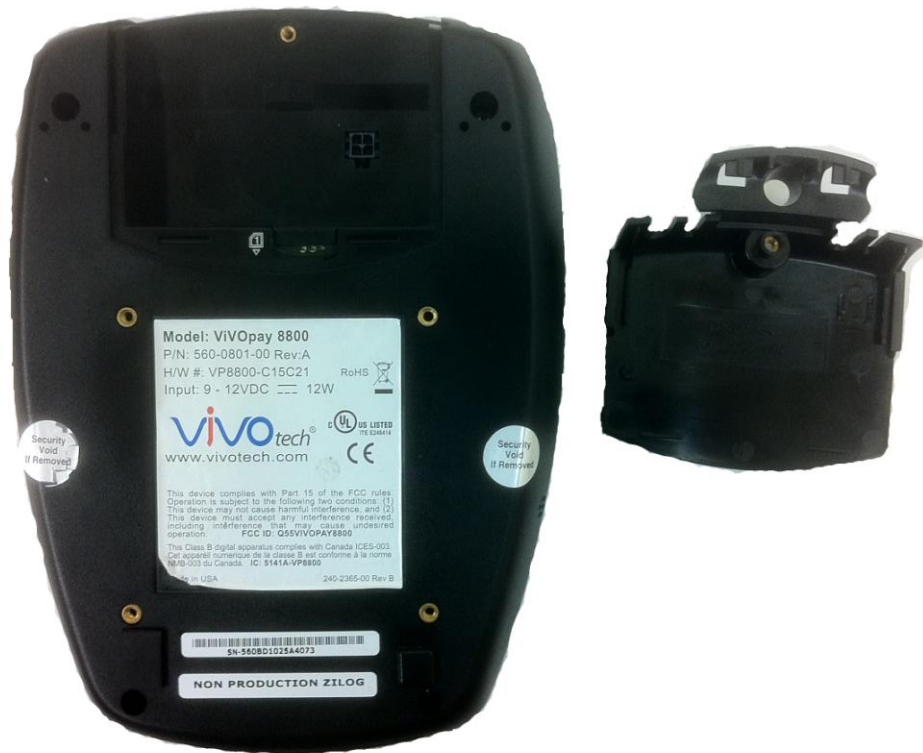
Figure 2. Bracket removed

3) Connect the power and data cables from the BT-POS8800-M to the ViVOPay reader.