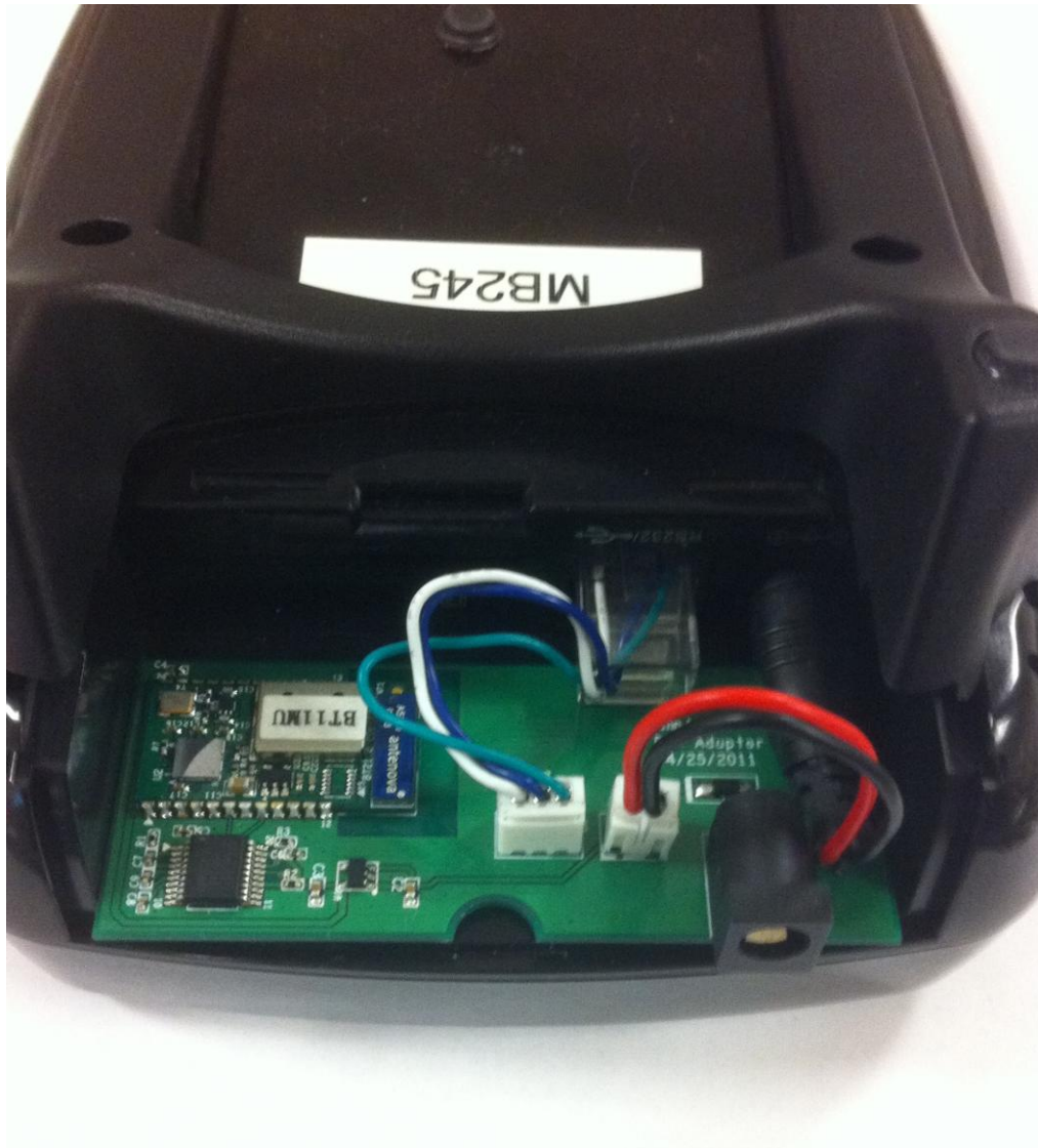
Figure 4. Arrangement of BT-POS8800-M Adapter and cables