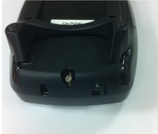
Figure 5. Put back cover

5) Install back cover on as per figure 5.